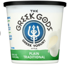
The Greek Gods Greek Style Yogurt selected varieties