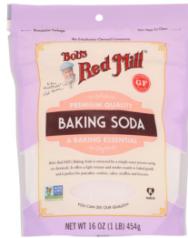
Bob's Red Mill Baking Soda

Homemade for the holidays. Celebrate better with Bob's Red Mill baking ingredients.