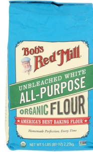
Bob's Red Mill Organic Flour selected varieties