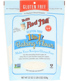
Bob's Red Mill 1 to 1 Baking Flour