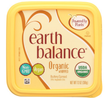
Earth Balance Organic Vegan Whipped Buttery Spread